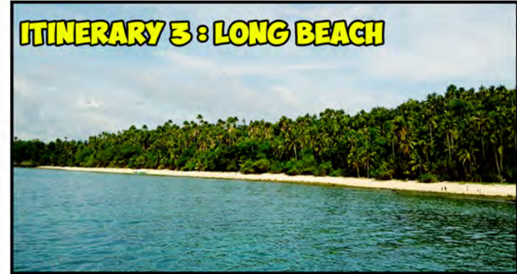
ITINERARY 3 : LONG BEACH