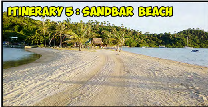
ITINERARY 5 : SANDBAR BEACH