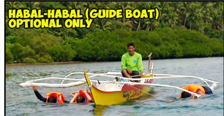
HABAL-HABAL (GUIDE BOAT) OPTIONAL ONLY

UNDER WATER CAVE (OPTIONAL PROGRAM ONLY BY USING HABAL HABAL GUIDE BOAT IS REQUIRED)