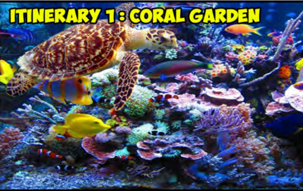
ITINERARY 1 : CORAL GARDEN