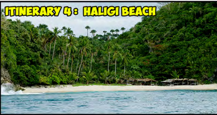
ITINERARY 4 : HALIGI BEACH